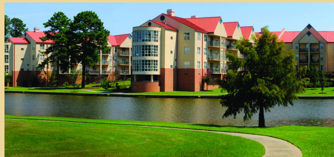
St. Catherine's Village www.stcatherinesvillage.com